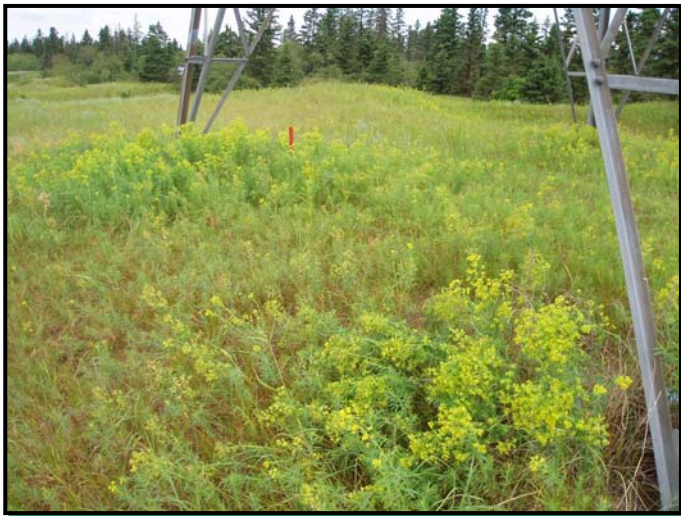
This picture shows a large patch of leafy spurge on top of a hill underneath a transmission tower. The orange stake shows the point of beetle release. July 2007.

Erik Dickson, Forestry Summer Student, Manitoba Hydro