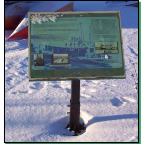
A Leafy Spurge awareness sign located at the Riverbank Discovery Centre, Brandon, MB.

The remaining two signs will exhibit management techniques in the control against this very aggressive invasive weed with one focusing on biocontrol, an environmentally friendly method of utilizing bugs that prey specifically on leafy spurge.