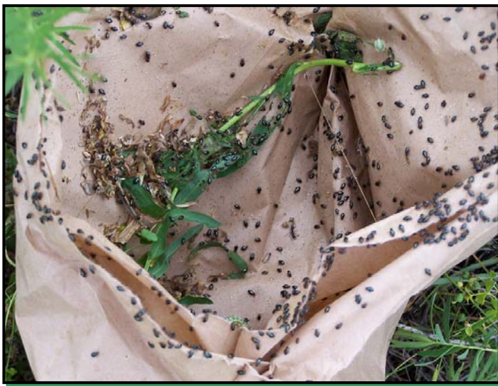
Liberating flea beetles ( Aphthosa lacertosa ) at a Manitoba nurse site.

with a couple of spurge plants to sustain the beetles for the trip home.