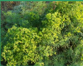
Leafy Spurge flowering in September