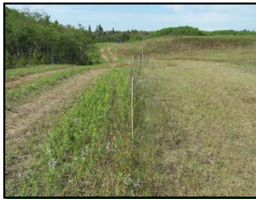
A fence line separating two paddocks of goats in SWPP. The goats had just occupied the paddock pictured on the right.

The management team had considered using goats along with the other controls for quite some time, but costs and logistics kept interfering with the plan.