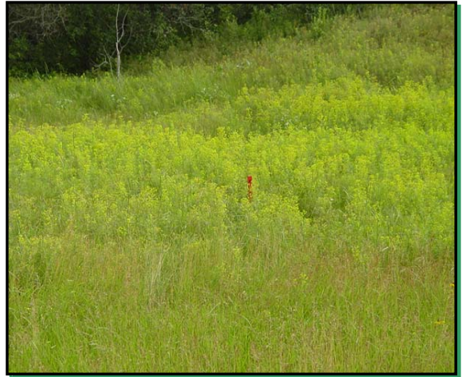
This picture is a biocontrol site along a transmission line right-of-way in a remote section of Spruce Woods Provincial Forreest. The orange stake in the centre of the picture shows the spot of beetle release within a large patch of leafy spurge. July 2006.

It was decided that the populations at these sites should be boosted to help establish a larger beetle