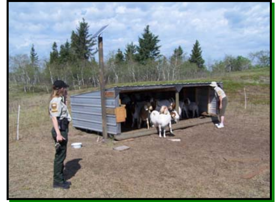
Goat shelter in SWPP

With a little help from Manitoba's Sustainable Development Innovations Fund (SDIF) Spruce Woods is embarking on a goat grazing project to help control both leafy spurge and aspen encroachment. Over the next five years, goats will graze from May to September on chosen sites within the park in hopes that, by the third grazing season, the density of leafy spurge will decrease significantly.