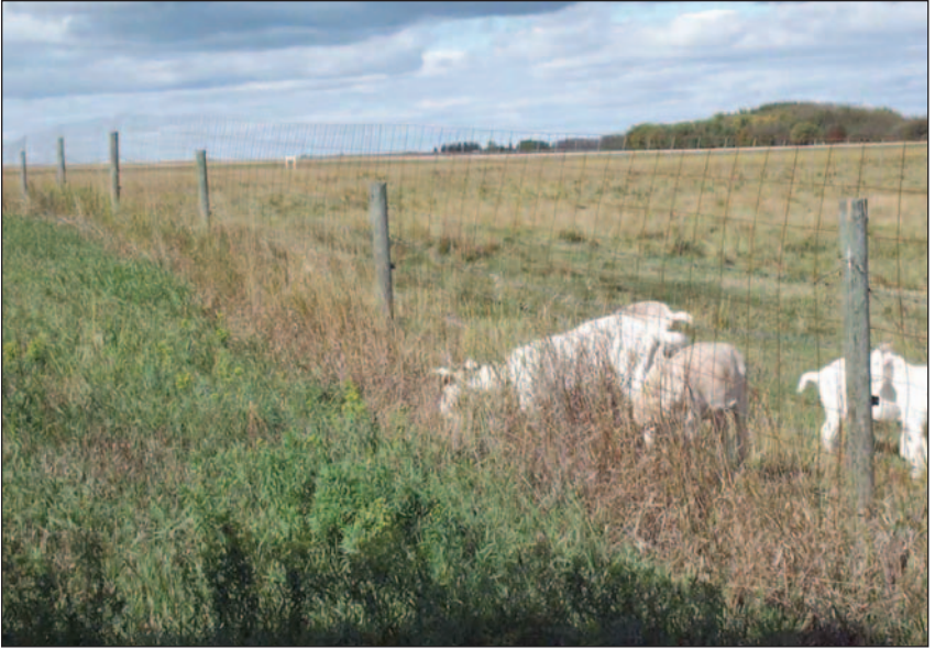
Goats will readily consume leafy spurge.

Multi-species grazing. Multi-species grazing is the practice of using two or more livestock species in the same grazing system. Multi-species grazing works to reduce leafy spurge infestations because different animals use different forage resources in the pasture.