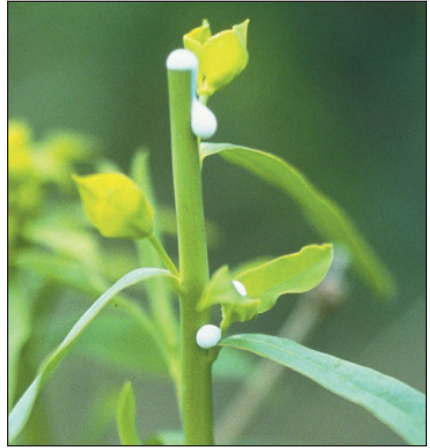
The milky white latex exuded from damaged plants is an irritant and a useful tool in identifying leafy spurge.

In early April, leafy spurge arises from a woody crown below the soil surface. The main growth of the plant occurs from April to July. The crown may produce several stems, giving the plant a shrubby appearance. Height of mature stems may vary from 16-32 inches (40-81 cm). The stems are hairless, with numerous linear-shaped, pale blue-green or green leaves. The leaves are \frac{3}{4} - 3 inches (2-7.5 cm) long, sessile and alternate, except for a whorl of leaves at the base of the inflorescence.