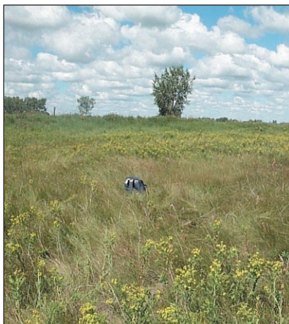
The halo of dead spurge can be used as an indication of beetle populations. This halo effect was created 3 years after a release of A. lacertosa .