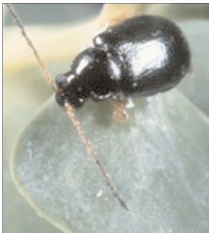
The Black flea beetle ( Aphthona lacertosa ) is one of the most successful at combating leafy spurge.